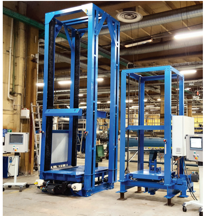
WRS 2600 and WRS 4000

The WRS consists of a robust steel construction featuring a pair of parallel steel load plates, worm gear screw jacks, electric motors and frequency converters plus a remote control panel and PLC-based measurement and reporting system.