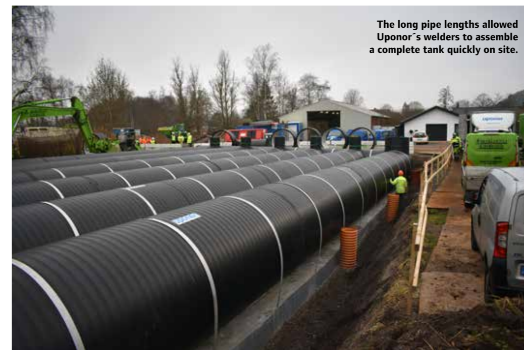
The long pipe lengths allowed Uponor's welders to assemble a complete tank quickly on site.