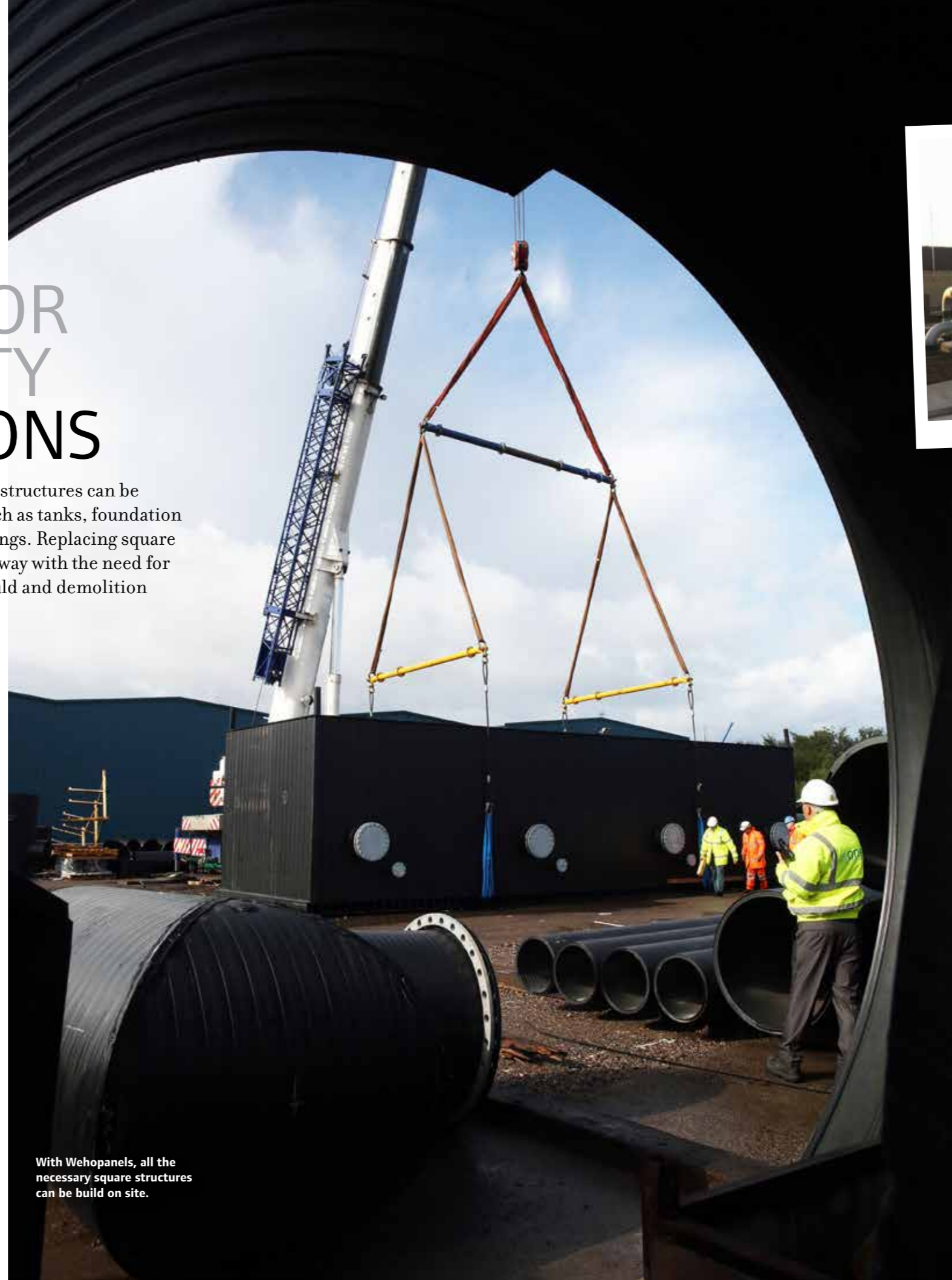
With Wehopanels, all the necessary square structures can be built on site.

Alanen says that Wehopanel WPW16 machines have recently been delivered not just to Uponor's own factories, but also to Weholite licensees in the UK, Japan, Canada, Turkey and France. A machine that will be delivered to Tanzania is under construction.