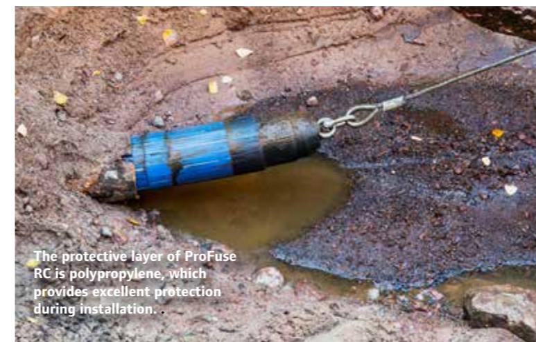
The protective layer of ProFuse RC is polypropylene, which provides excellent protection during installation.