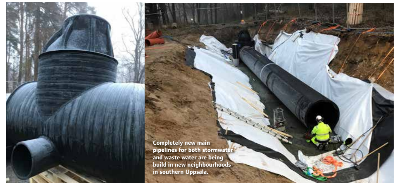
Completely new main pipelines for both stormwater and waste water are being built in new neighbourhoods in southern Uppsala.

Uppsala is one of the oldest cities in Sweden. Today, it is also one of the fastest-growing cities in the country. Over the next few years, completely new neighbourhoods with approximately 14,000 new homes will be built in southern areas of the city. Weholite ensures safe and reliable transportation of stormwater and waste water – and safety is of utmost importance because the newly installed pipelines will run through a water protection area.