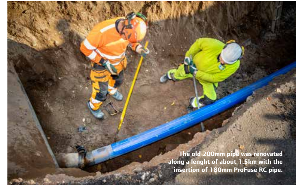
The old 200mm pipe was renovated along a length of about 1.5km with the insertion of 180mm ProFuse RC pipe.

"It's unusual for lanes on this road to be closed off," says Lempinen.