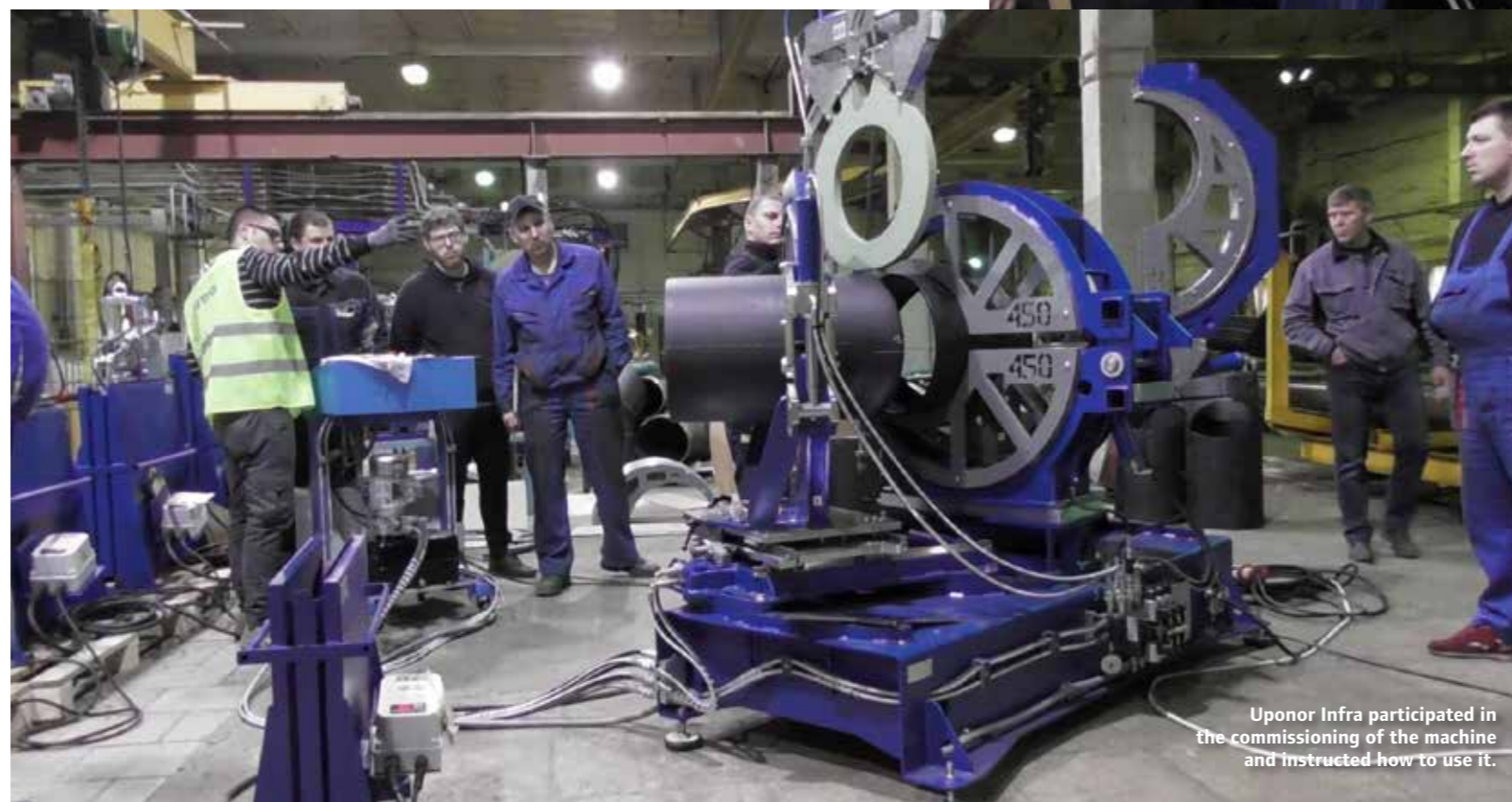
Uponor Infra participated in the commissioning of the machine and instructed how to use it.

"The most important task during commissioning is to see to it that the machine is handed over safely and appropriately from the manufacturer to the customer. This ensures high machine performance and high-